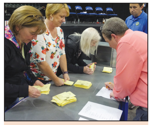
Union representatives then tallied the votes, again monitored by member volunteers. The volunteers at each voting line then signed each tally sheet to verify accuracy.