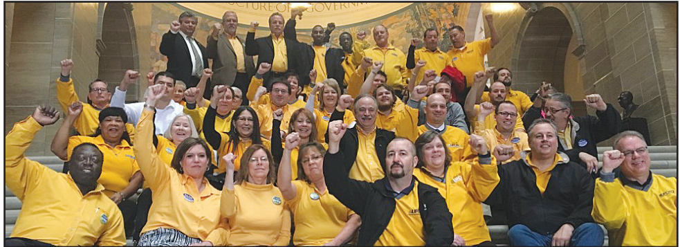
Partners and officers of Local 655 proudly wearing UFCW gold during a recent lobbying trip to the Missouri State Capitol.

Local 655 works hard on behalf of all our partners to lobby lawmakers in Jefferson City.