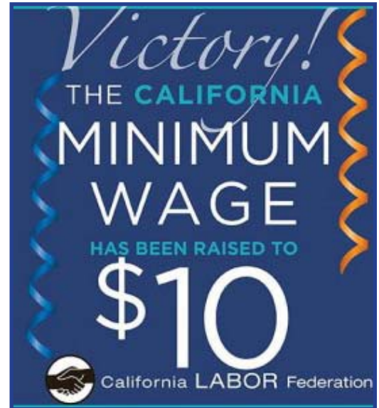
UFCW locals in California took action to help raise the state's minimum wage to $10.

At the signing of the bill, Governor Brown's remarks made it clear he heard their message loud and clear.