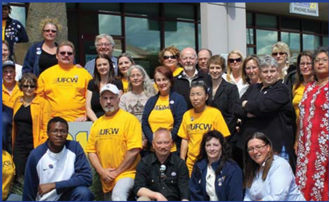
UFCW Locals 21, 367 and Teamsters Local 38 grocery workers sent a strong message to the grocery chains by overwhelmingly voting to authorize a strike.

UFCW Locals 21, 367, and Teamsters Local 38 sent a strong message of solidarity to Fred Meyer, Safeway, QFC, and Albertsons last week when they voted overwhelmingly to authorize a strike. The 98 percent strike authorization vote is the workers' latest step in their fight for fair treatment, pay, and benefits. Contract negotiations will continue on October 10 and 11. Workers say they expect the chains to now come to the table with a set of serious proposals.