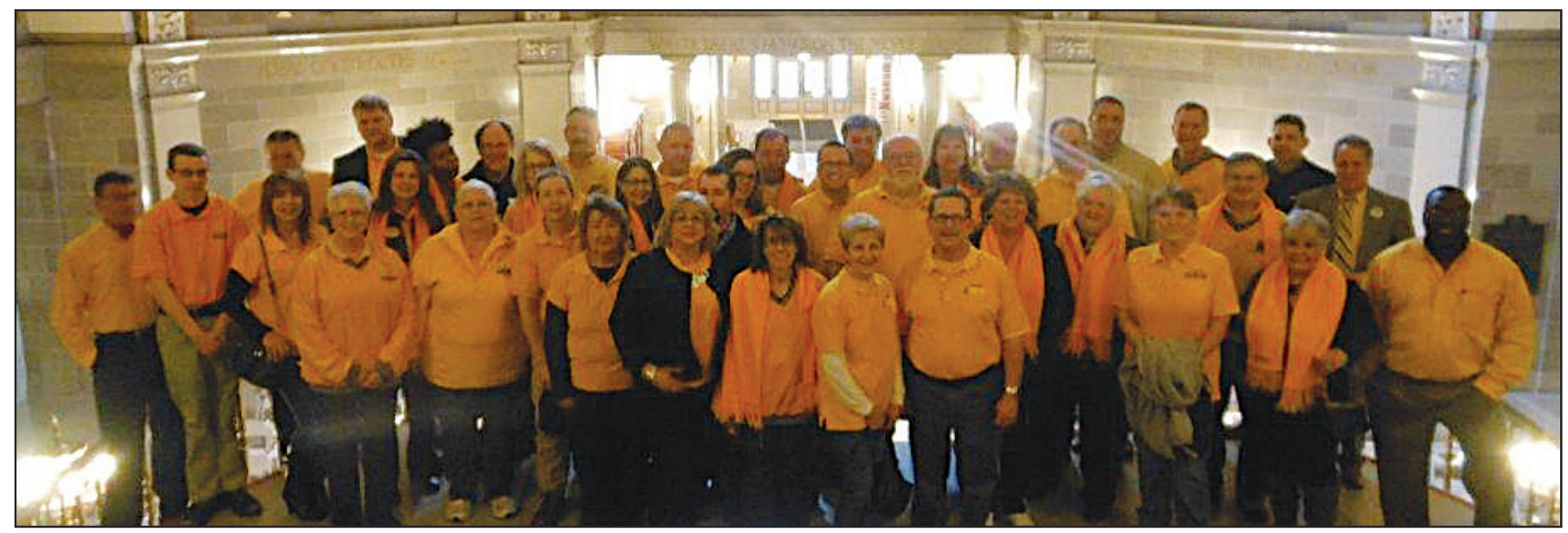
Members of UFCW Locals 655, 2 and 88 spent two days at the State Capitol in Jefferson City talking with State Representatives and Senators about supporting legislation that help working families.

Jefferson City – There's been a "War on Workers" brewing in the Missouri State Capitol, and last week strong union members of UFCW Locals 655, 2 and 88 shared their opinions, visiting state lawmakers to urge them to support laws that help, not hurt, Missouri working families.