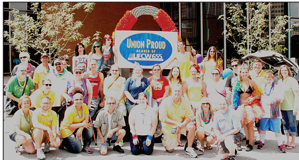
LOCAL 655 SHOWS ITS PRIDE Local 655 officers and members were out in full force Saturday, marching to support the LGBTQIA (lesbian, gay, bisexual, transgender, questioning, intersex, asexual and ally) community at the 2015 PrideFest Parade held in downtown St. Louis—two days after a landmark Supreme Court ruling making gay marriage legal in the United States.

Some Republican members of the General Assembly may want to reflect on their core principles before they return to Jefferson City for the September veto session. These anti-worker proponents should consider joining the numerous members of their party who stand by their core principles — and with Missouri workers in opposing 'right-to-work' laws.